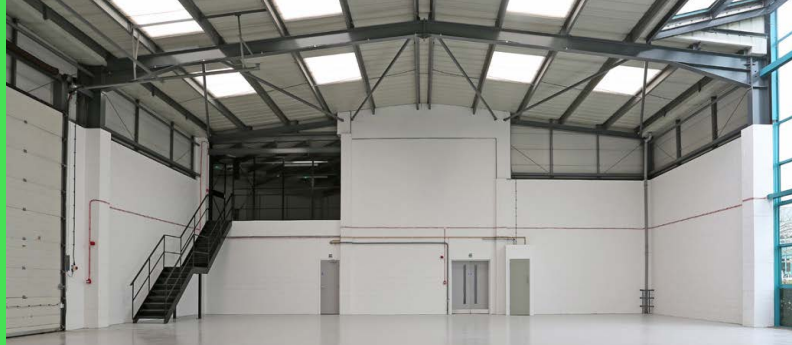
Typical warehouse interior