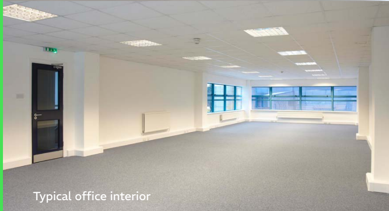
Typical office interior