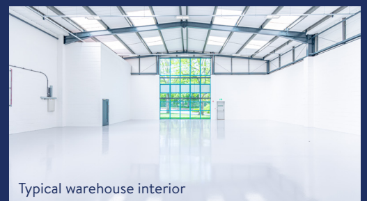
Typical warehouse interior